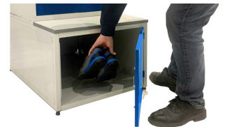
MFC Top Storage (450mm high)