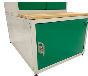
Oak Top Storage (450mm high)