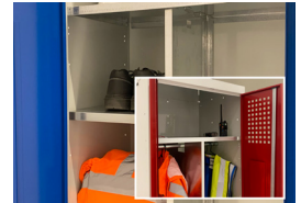
Close Up Internal Configuration